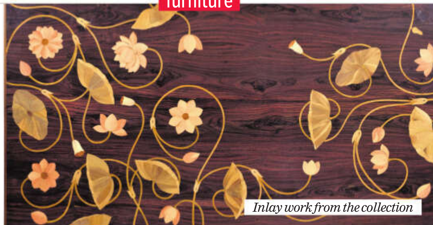
Inlay work from the collection