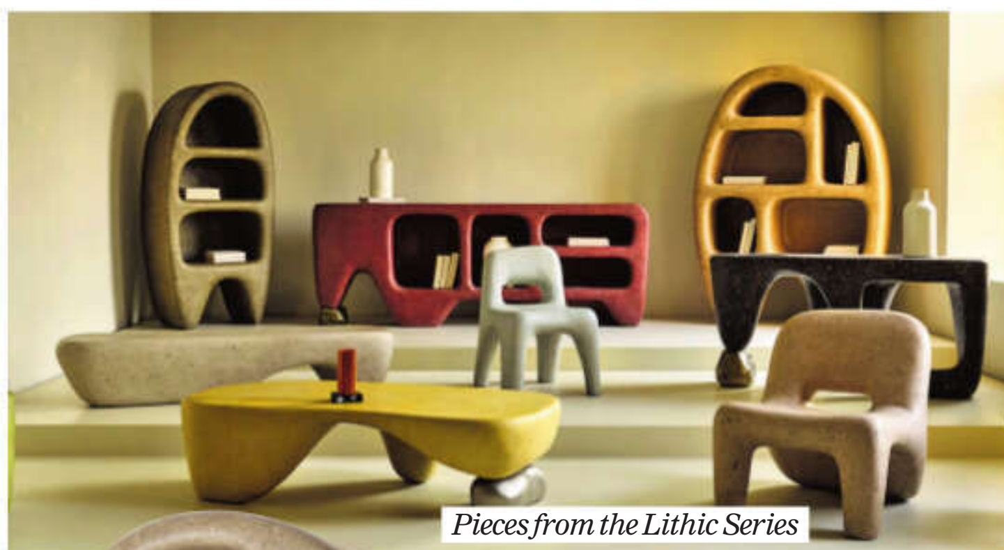
Pieces from the Lithic Series

The series, which is also available at the recently opened Experience Centre in Gurgaon is a masterclass in blending functionality and artistry. From seating to tables and storage, each piece embraces sculptural beauty while honoring the philosophy of wabi-sabi — the beauty of